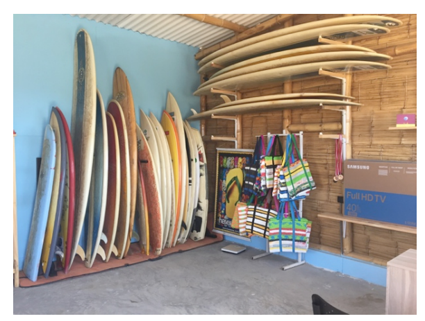
Thanks inter alia to the help of FdE, the future for the young people in Lobitos just became a little brighter!

In less than three months the Surf Shop/Meeting Centre for Visitors was completed.