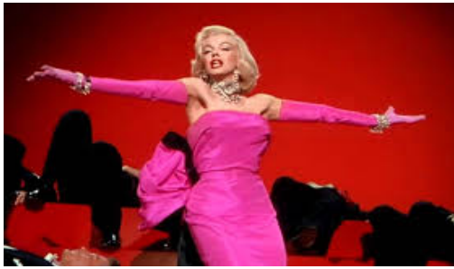
Marilyn Monroe in "Gentlemen prefer blondes, 1953

A wonderful colour with a fascinating history is shocking pink. It was inspired by a beautiful pink diamond, called "Tête de Bélier", which the socialite Daisy Fellowes (1890 – 1962) – another editor of a fashion magazine, this time Harper's Bazaar - had bought from Cartier. Its rare colour inspired the fashion designer Elsa Schiaparelli to invent shocking pink. The colour was used on the packing of her perfume Shocking and became fashionable. To add to the notoriety, the perfume bottle was shaped as the torso of the actress Mae West.